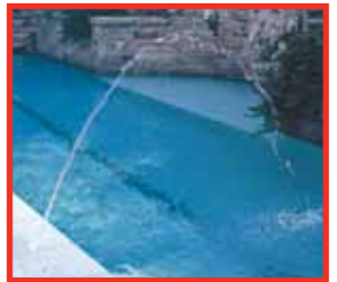
Single 5/16" stream