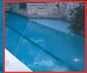
Single 3/16" stream