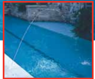
Single 1/4" stream